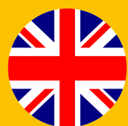
CHART OF SERVICES